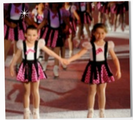
2009 - "MARIE" FROM DONNY & MARIE