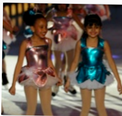
2009 - FLOWERS